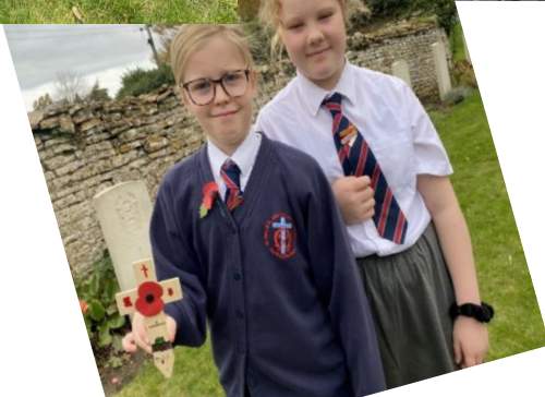
Year 6 visited the War Graves at the church