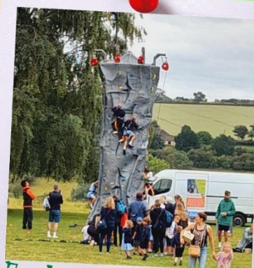
Fenland Climbing wall was so popular!

WE NEED YOU! Could you be the next PFA Chairperson? *