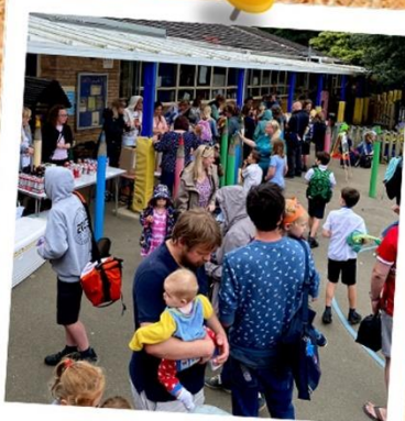
Enjoyed by all!