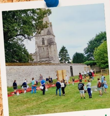
The floor is Lava!